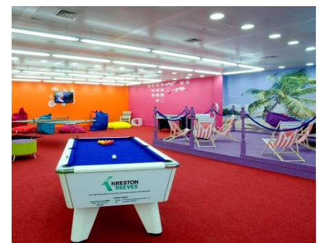
The Playroom: Relax and wind down at the end of the day with a game of pool, table tennis or practice your putting.