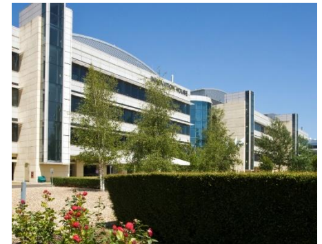
Make an impression with your clients with prestigious site.